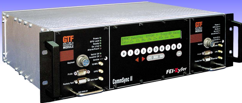
CommSync II Model 385

CommSync II ® is a fully-redundant modular time and frequency system, combining dual GPS receivers, oscillators, and up to 13 output option modules in a single 3U chassis. The heart of the CommSync II is the GPS Time and Frequency (GTF) Module. It is self-contained, with Quartz Crystal (OCXO) or Rubidium Atomic oscillator options, as well as Civil or Military GPS receiver options. The GTF is a hot-swappable, front panel plug-in module (two slots available for redundancy).